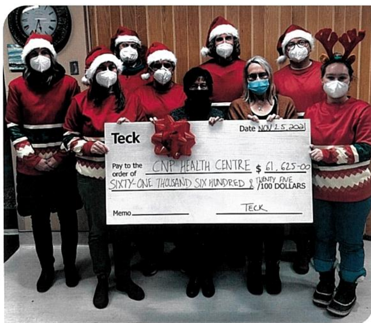
Teck donated $61,625

Donations were again gratefully accepted by Teck Coal late in 2021 in lieu of their Christmas parties that were cancelled due to Covid. The Blairmore Lions and the Coleman Legion also generously donated to the foundation this past year.