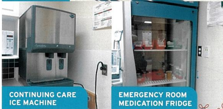
CONTINUING CARE ICE MACHINE