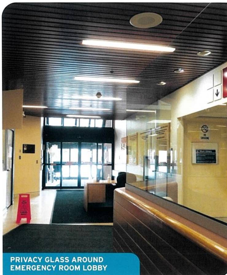
PRIVACY GLASS AROUND EMERGENCY ROOM LOBBY