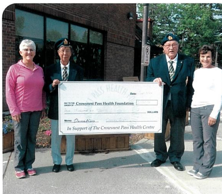
Coleman Legion donated $5,000