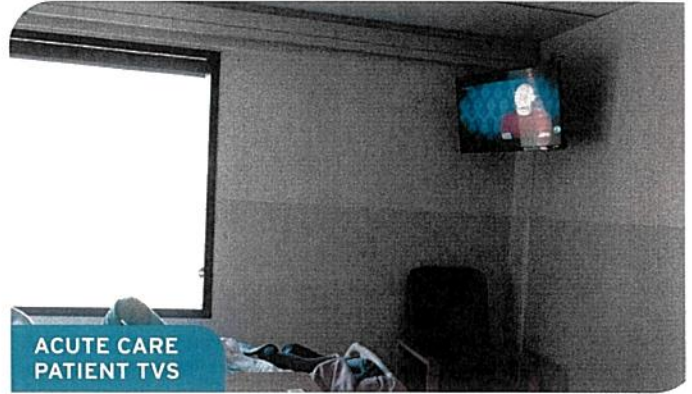
ACUTE CARE PATIENT TVS