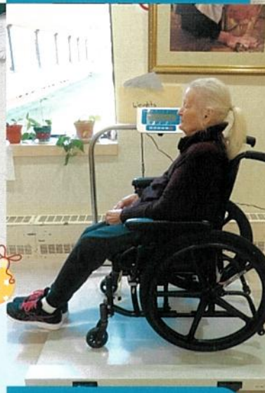
LTC WHEELCHAIR SCALE