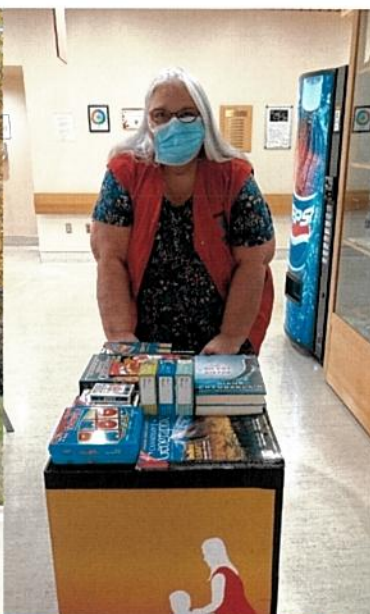
VOLUNTEER RESOURCES VISITATION CART